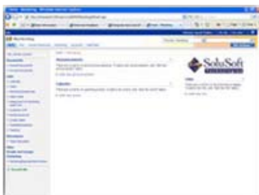
Marketing and Sales